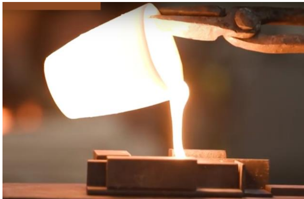
Creating simulant radioactive waste glass in the laboratory, in preparation for groundwater leaching tests.

Funder: Nuclear Waste Services , through the NWS Research Support Office